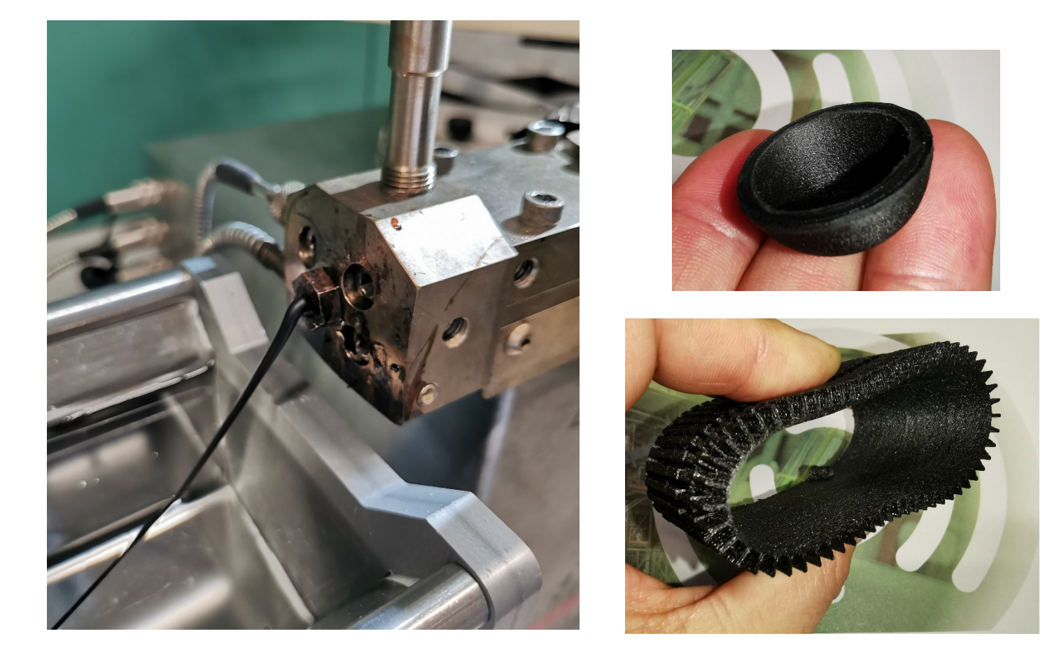
Fig.2 : Compounding tests, production of composite filaments and samples of 3D-printed polymer composites.

Tests showed that the good processability of char as polymer additive producing filaments for 3D-printing can be achieved, adhering boundary conditions, e.g., regarding the char properties, such as content of volatiles, particle size, and limits of char to polymer ratios.